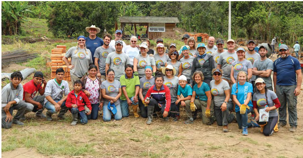
July 2017 Expedition Group