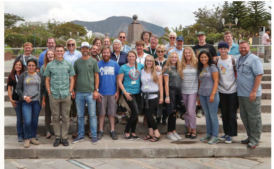
August 2017 Expedition Group