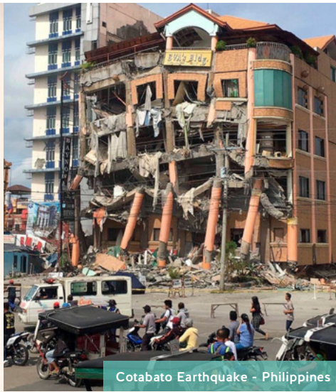
Cotabato Earthquake - Philippines