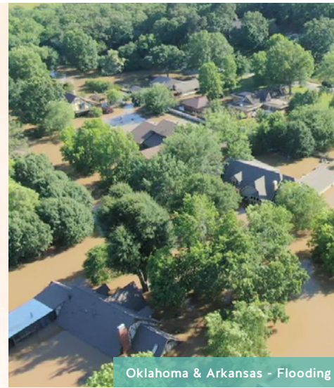
Oklahoma & Arkansas - Flooding