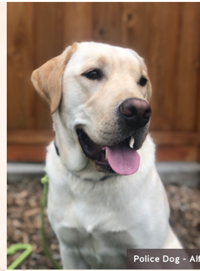
Police Dog - Alf