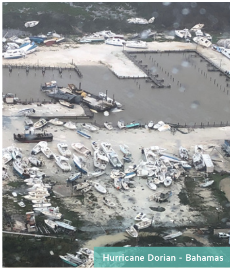
Hurricane Dorian - Bahamas